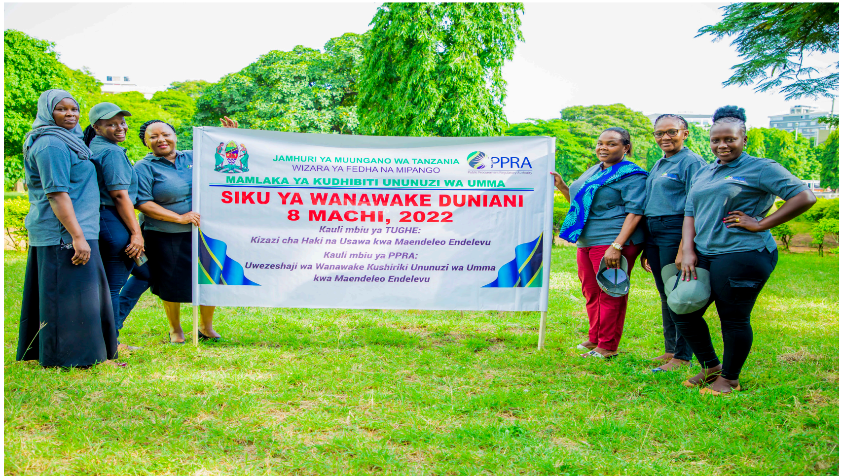
Female staff members of PPRA's Coast Zonal Office carry a TUGHE-PPRA placard during festivities to mark International Women's Day, on March 8, 2022 in Dar es Salaam