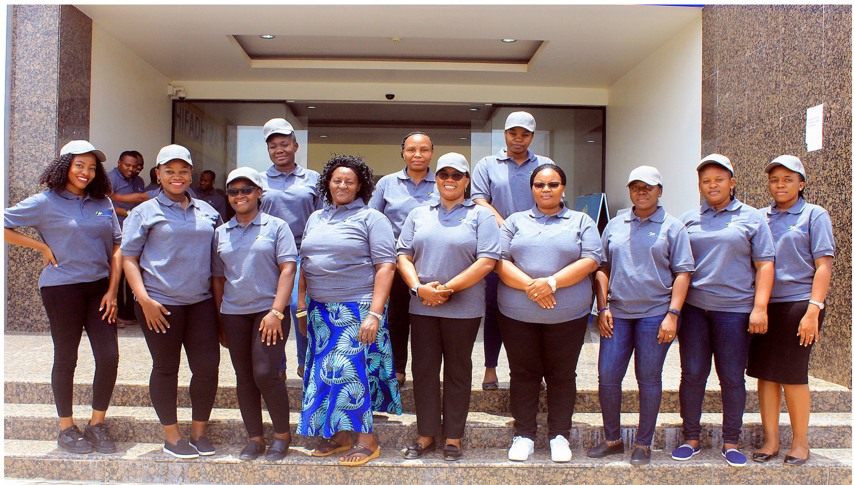
Female staff of PPRA Head Office in a group photo during festivities to mark International Women's Day, on March 8, 2022 in Dodoma